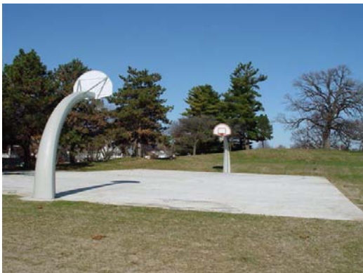
Good Park Basketball Court

This project has five locations. A new basketball court and new retaining wall has been constructed at Good Park; a new basketball court at M.L. King Park; new sidewalk and curbing around the existing playground equipment at Woodlawn and Burke Parks; and a new bike trail in the Three Lakes area (south of Army Post Road and east of Indianola Avenue). The contractor, T.K. Construction, Inc., has nearly completed the work.